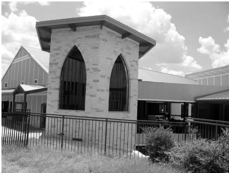
New Adoration Chapel with stone and arch shaped window openings.